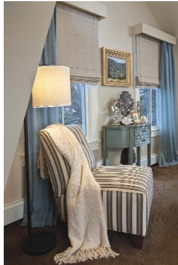
By using creative space planning, Bresin was able to change two second-floor bedrooms into three bedrooms and a sitting area, all of which are accessed by the main staircase in the original part of the house. Sea horses, a favorite of the wife, add playful touches in the guest area. Matching nightstands, mirrors and swing lamps anchor the bed in the guestroom, which offers two armless chairs as perfect places for relaxing.

in Upper Montclair. Bresin had successfully guided them through major renovations in 1995 that included a new kitchen. This time there were only a few caveats. The couple loved their kitchen and wanted to retain the look, and it was important to the wife that the new sinks and commercial range be white.